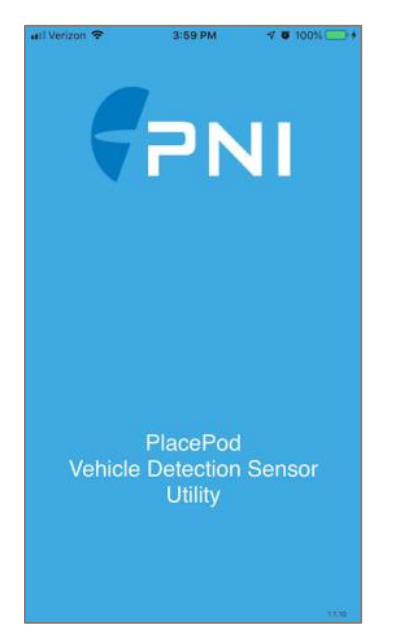
Figure 3-3: Utility Application Main Screen

To download the PlacePod Vehicle Detection Sensor Utility, visit the iOS App Store at: