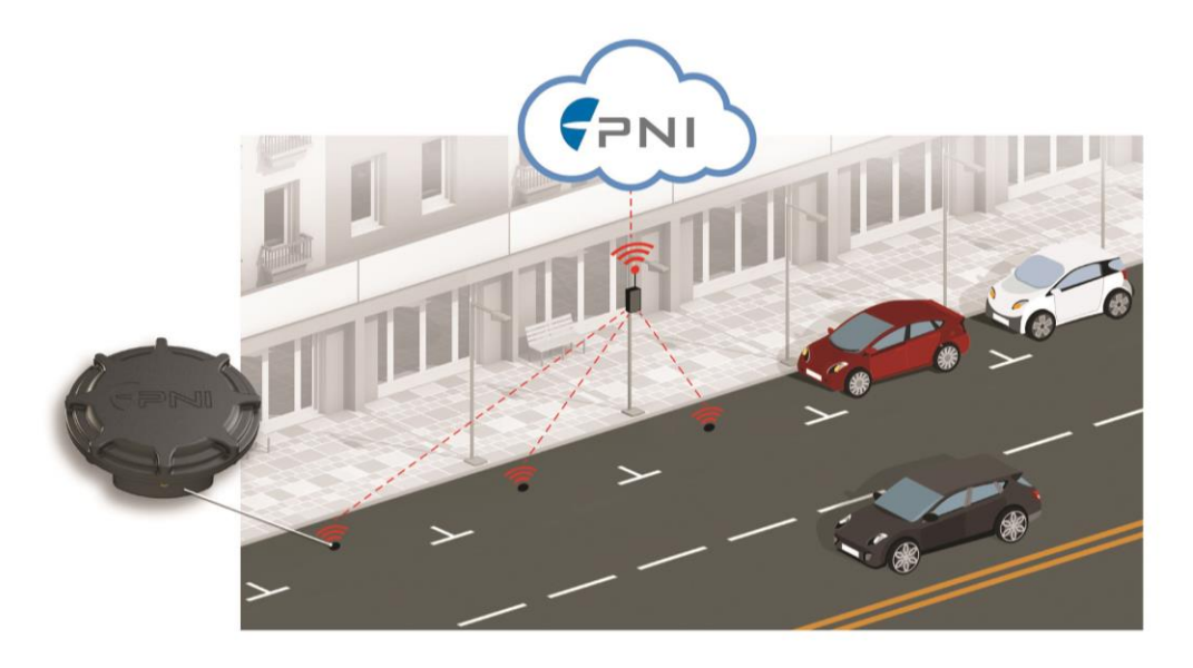
Figure 1-1: PNI Parking Solution Overview

PlacePod is an in-ground or surface-mounted vehicle detection sensor that communicates with a LoRa gateway to provide real-time parking data. It provides accurate vehicle detection in parking spaces, up to 7 years of battery life, and is stable over temperature fluctuations, even in harsh environments.