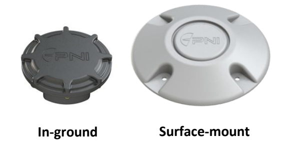
Figure 2-2: PlacePod vehicle detection sensor models

Generally, the in-ground model should be the default since placing the PlacePod just below the parking surface provides the most durable installation. However, in certain circumstances, such as in parking garages or other applications where there is limited ability to excavate the parking surface, the surface-mount model is recommended.